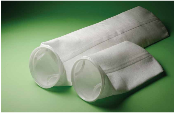
The UNIBAG filter is available in two sizes, two media material and two ring material options.